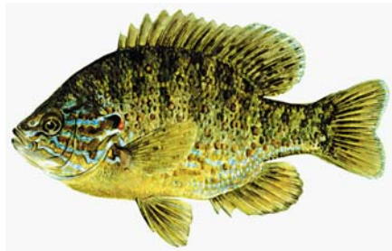
(c) pumpkinseed _____